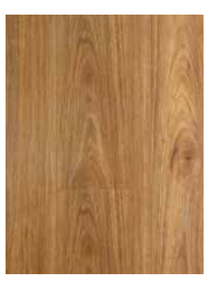
SPOTTED GUM •

• These colours are also available in 8mm AC3 Size: 1215 x 195 x 8mm, 1.895m²/Ctn Please check for availability