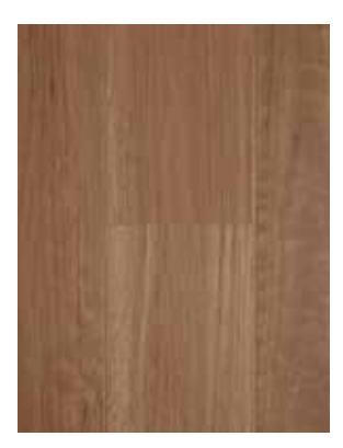
AGED BLACKBUTT • New Arrival 2019