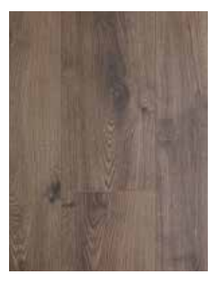
TAWNY OAK •