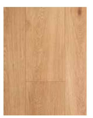
CLASSIC OAK •