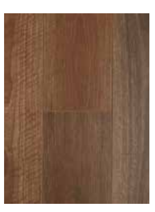
AGED SPOTTED GUM • New Arrival 2019