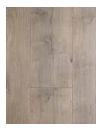
MYSTIC OAK •