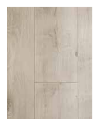
NORDIC OAK •